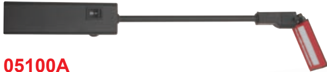
05100A 18" Rigid Shaft Lighted Inspection Tool