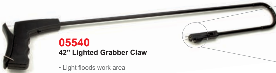
05540 42" Lighted Grabber Claw