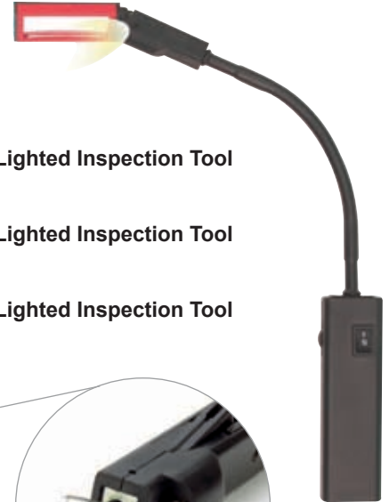
05420 42" Flexible Shaft Lighted Inspection Tool