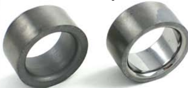
Before Diamond Flex-Hone