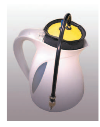
Example: 2 - Kettle leak testing.

An example of the versatility of these expandable devices is provided by a recent customer requirement to test kettle bodies for leaks.